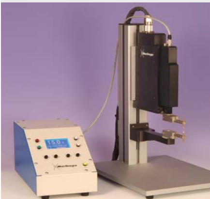
Universal Opposed Mach 1 Weld Head

Available in opposed or parallel gap configuration, these innovative units represent the state of the art in weld head technology and may be connected to computers for SPC quality control and setup.